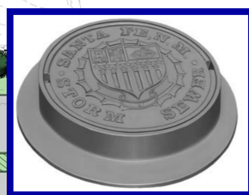
EXAMPLE - GROUND MARKER