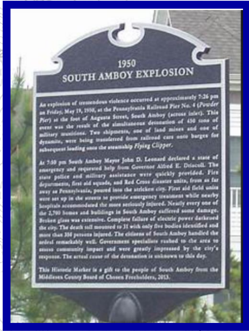
EXAMPLE - HISTORIC MARKER