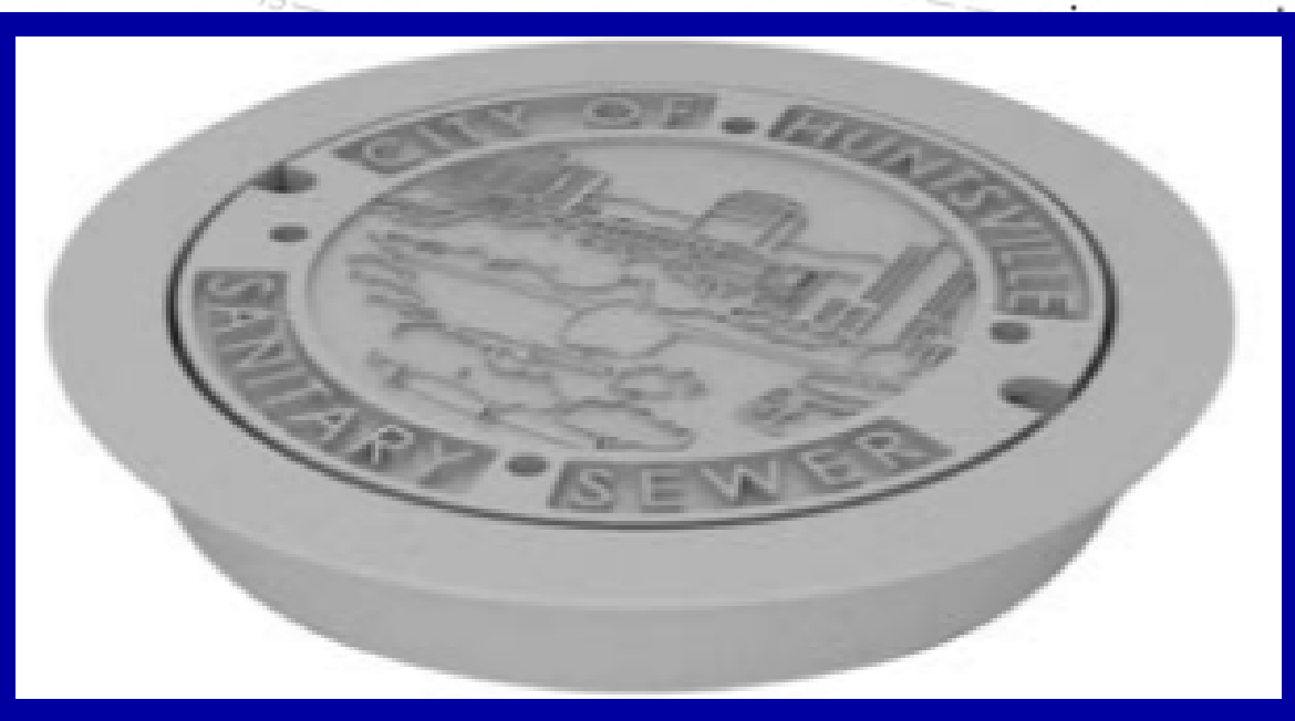
EXAMPLE - GROUND MARKER