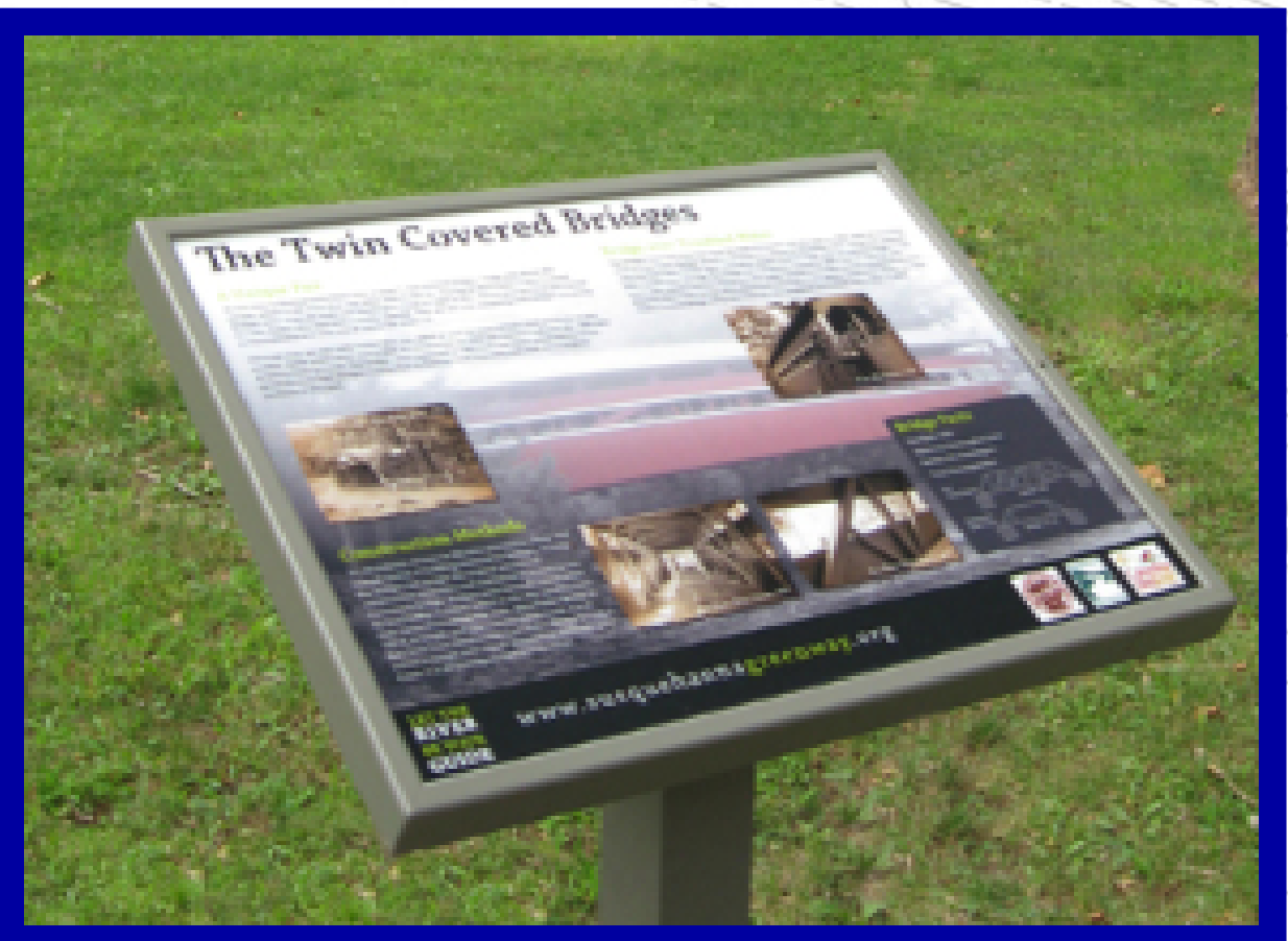
EXAMPLE - INTERPRETIVE SIGN