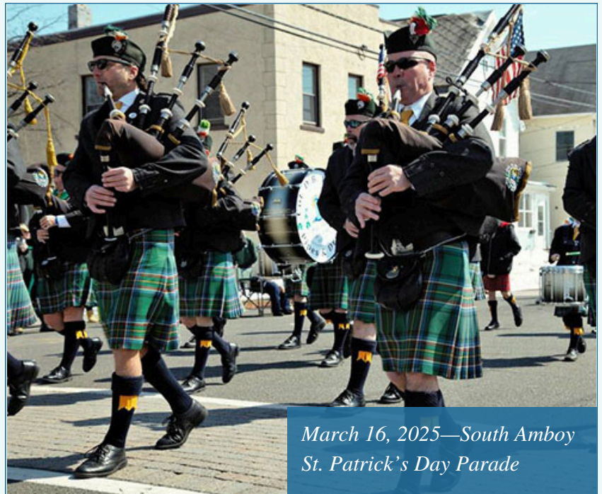
March 16, 2025—South Amboy St. Patrick's Day Parade

Thank you for being part of what makes South Amboy a great place to live, work, and thrive!